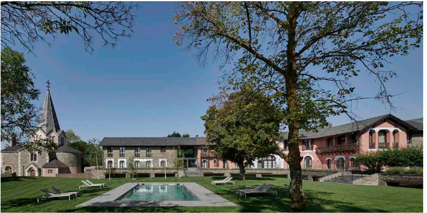
The Mercer Hotel Torre del Remei is an icon of the hotel industry that offers its clients luxury facilities, as a pleasant reading room or a heated outdoor pool...