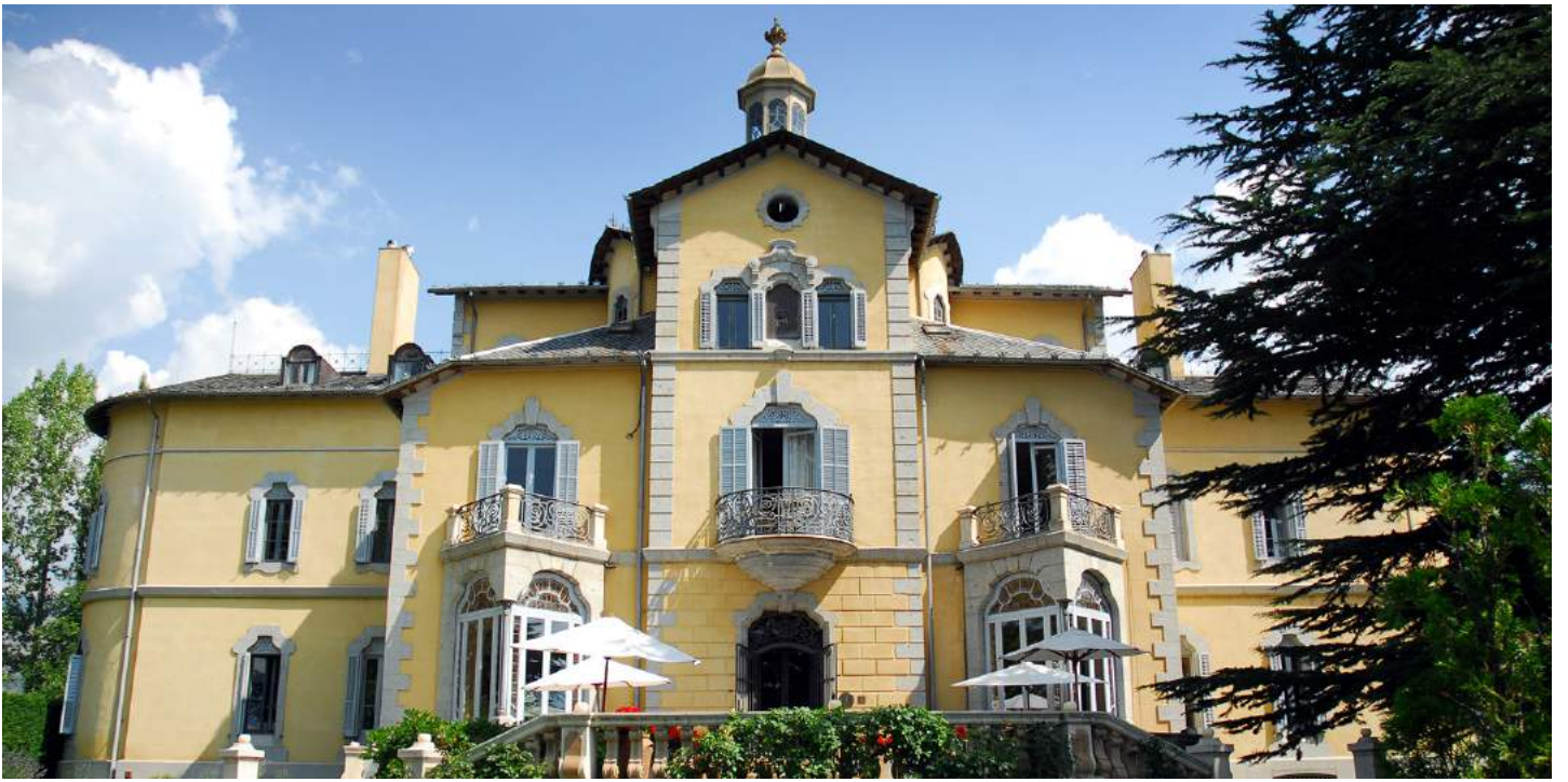
The Mercer Hotel Torre del Remei is an icon of the hotel industry that offers its clients luxury facilities, as a design cocktail bar, a pleasant reading room or a heated outdoor pool...